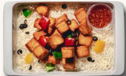
Cod Fish Tofu Bites 👑 fish meat tofu cube, tricolour capsicum, thai chilli sauce pescatarian, contains dairy, soy, wheat