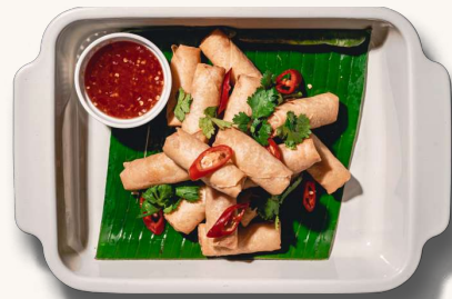
Vegetable Spring Roll 🌿👑 cabbage, tofu, wood ear mushroom vegan, contains soy, wheat