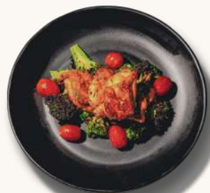
Grilled Farm Fresh Chicken 👑 indian inspired cajun chicken thigh, charred broccoli, slow baked cherry tomato contains allium