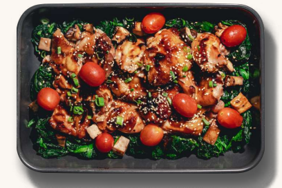
Chiba's Outback Teriyaki Chicken teriyaki chicken, shiitake mushroom, spring onion, spinach contains allium, wheat, soy