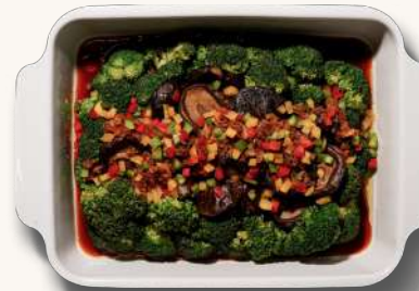
Braised Mushroom & Broccoli 🌿 superior soy sauce, garlic, tricolour capsicum vegan, contains allium, soy, wheat