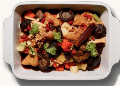
Soy Braised Tau Kee & Tau Pok 🌿 camellia mushroom, star anise, goji berry vegan, contains soy, wheat