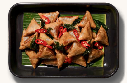
Indian Spiced Samosa 🌿 turnip, carrot, mixed spice vegan, spicy, contains allium, wheat