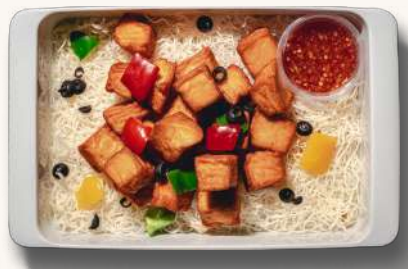
Cod Fish Tofu Bites 👑 fish meat tofu cube, tricolour capsicum, thai chilli sauce pescatarian, contains dairy, soy, wheat