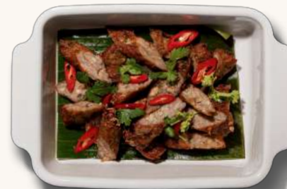
Prawn Roll (Nghoh Hiang) 👑 crispy beancurd skin, mushroom, five spice powder contains allium, soy, shellfish