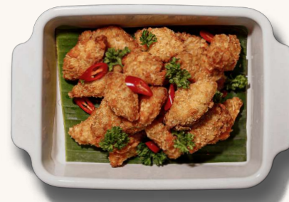
Seafood Croquette deep fried golden seafood potato pescatarian, contains allium, dairy, egg, shellfish, wheat