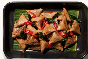
Indian Spiced Samosa 🌿 turnip, carrot, mixed spice vegan, spicy, contains allium, wheat