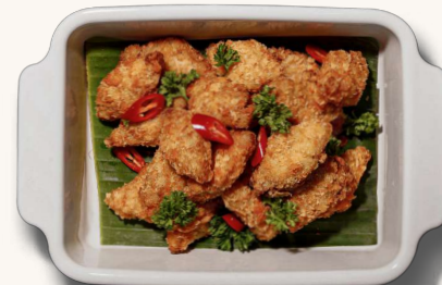
Seafood Croquette deep fried golden seafood potato pescatarian, contains allium, dairy, egg, shellfish, wheat