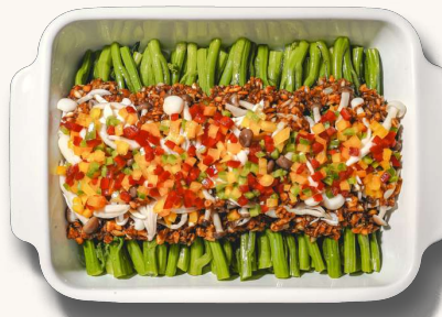
Shanghainese Wok-Fried Vegetables 🌿 confit garlic, diced tricolour capsicum, duo beech mushroom, premium soy sauce vegan, contains allium, soy, wheat