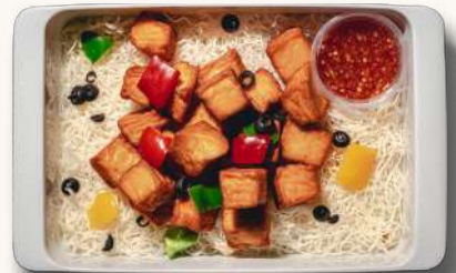
Cod Fish Tofu Bites 👑 fish meat tofu cube, tricolour capsicum, thai chilli sauce pescatarian, contains dairy, soy, wheat