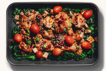
Chiba's Outback Teriyaki Chicken teriyaki chicken, shiitake mushroom, spring onion, spinach contains allium, wheat, soy