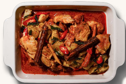
Grain's Curry Chicken 🌶️ 👑 nyonya curry, masala powder, lemongrass spicy, contains allium, soy