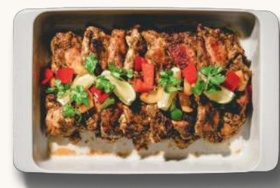
Roasted Chermoula Chicken traditional morrocan rub, tricolour capsicum chunk, fresh lime contains allium