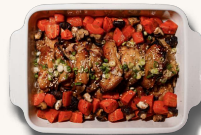
Miso Glazed Chicken miso, shiitake mushroom, sesame seed contains allium, soy, wheat