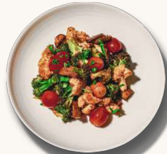
Roasted Rainbow Vegetable 🌿👑 cajun oil, roasted assorted vegetables at 250 degrees vegan, contains allium