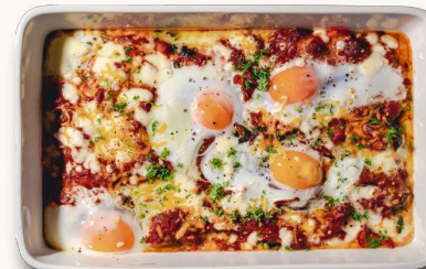
Oven Baked Shakshouka 🌿 sauteed garlic spinach, romesco sauce, egg, parmesan cheese shred vegetarian, contains allium, dairy, egg