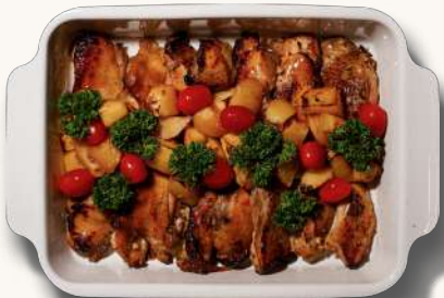
Honey Mustard Chicken 👑 dijon mustard, italian parsley, maple syrup contains allium, wheat, soy