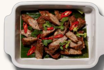
Prawn Roll (Nghoh Hiang) 👑 crispy beancurd skin, mushroom, five spice powder contains allium, soy, shellfish