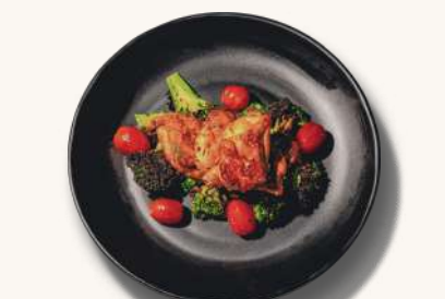
Grilled Farm Fresh Chicken 👑 indian inspired cajun chicken thigh, charred broccoli, slow baked cherry tomato contains allium