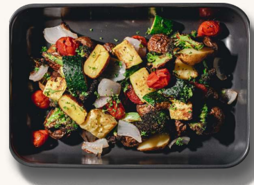
Charred Cumin Vegetables 🌿 natural cumin powder from china, baby potato, broccoli, zucchini, cherry tomato vegan, contains allium