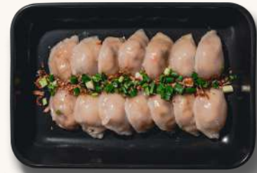
Steamed Mini Soon Kueh 🌿 turnip, carrot, mushroom vegan, contains wheat