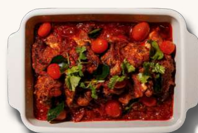
Kampung Ayam Masak Merah 🌶️ 👑 24 hour marinated boneless chicken, lemongrass and lime leaf scented sambal ketchup sauce spicy, contains allium, shellfish, soy, wheat