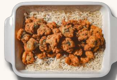
Japanese Karaage lightly battered chicken, thai chilli sauce contains allium, dairy, soy, wheat