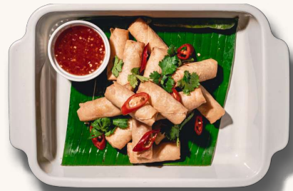
Vegetable Spring Roll 🌿👑 cabbage, tofu, wood ear mushroom vegan, contains soy, wheat