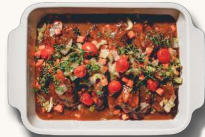
Grandma's Chicken Casserole traditional chicken gravy, mirepoix, garden fresh thyme contains allium, egg, wheat