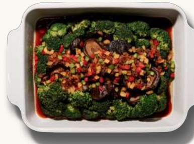
Braised Mushroom & Broccoli 🌿 superior soy sauce, garlic, tricolour capsicum vegan, contains allium, soy, wheat