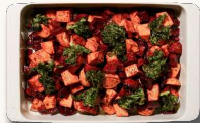
Maple Balsamic Sweet Potato 🌿👑 toasted black pepper, cinnamon, kale, maple syrup vegan