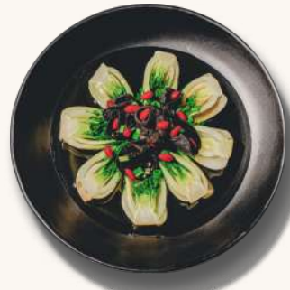
Wok Braised Nai Bai and Black Fungus 🌿 superior mushroom oyster soy sauce, crunchy black fungus, poached nai bai vegan, contains allium, soy, wheat