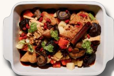
Soy Braised Tau Kee & Tau Pok 🌿 camellia mushroom, star anise, goji berry vegan, contains soy, wheat