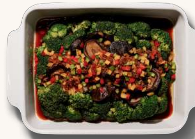
Braised Mushroom & Broccoli 🌿 superior soy sauce, garlic, tricolour capsicum vegan, contains allium, soy, wheat