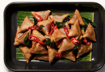
Indian Spiced Samosa 🌿 turnip, carrot, mixed spice vegan, spicy, contains allium, wheat