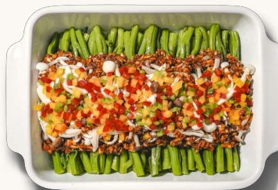
Shanghainese Wok-Fried Vegetables 🌿 confit garlic, diced tricolour capsicum, duo beech mushroom, premium soy sauce vegan, contains allium, soy, wheat